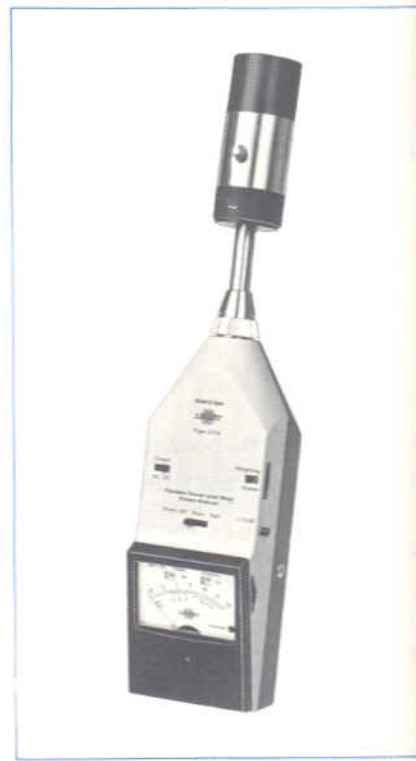
Fig.2. The 4230 fitted to the Sound Level Meter 2215

onator, which eliminates the stiffness factor and makes the resonant frequency independent of ambient pressure. (The resonant frequency of a Helmholtz resonator depends only on the volume of the cavity and the length and cross section of the constricting neck). This